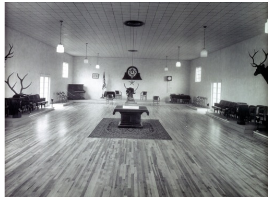
The new lodge hall as it appeared in 1949.

Over the years it has been remodeled and in 1948 the current hall was built. In 1971, the north wing was constructed to provide a kitchen and dining area.